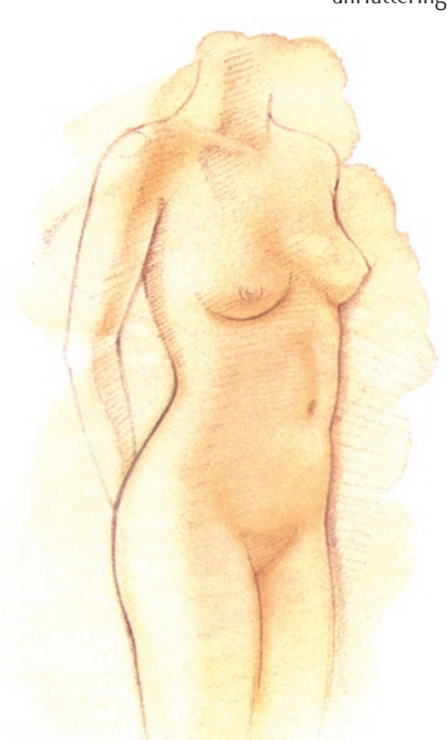
Following Liposuction, Excess fat has been removed from the abdomen and waist, hips and buttocks, and inner and outer thighs